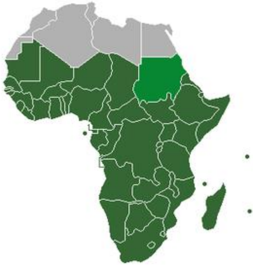
Figure 1: Map of Africa

The economy of Sub-Saharan Africa is dependent on trade, agriculture and human resources of the region. The region is expected to reach a GDP of $29 trillion by 2050. There is high level of income inequality which has implications on the transport mode choices particularly among the city dwellers. Poor transport infrastructures in Sub-Saharan Africa represents one of the most limiting factors to economic growth and achievements of the Millennium Development Goals (MDG). It has been argued that infrastructure investments contributed to more than half of improved growth performance between 1990–2005 and increased investments is necessary to maintain growth and tackle poverty [5].