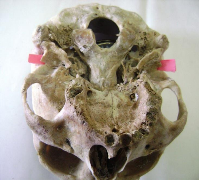
Figure-1: Bilateral U shaped foramen tympanicum