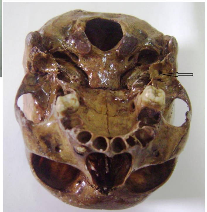
Figure-4: Right side irregular shaped foramen tympanicum