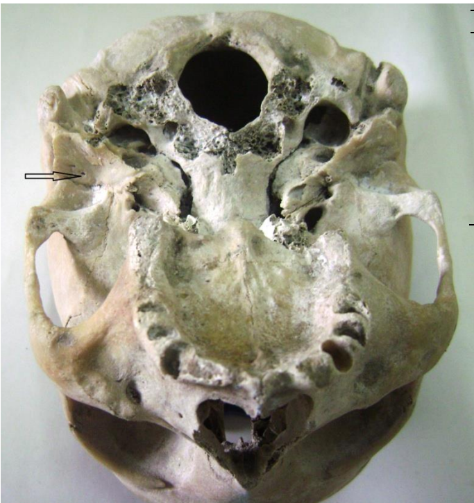
Figure-2: Left side pin point shaped foramen tympanicum